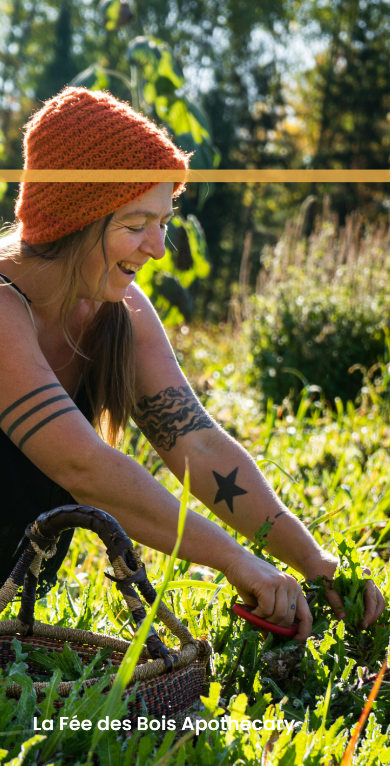
La Fée des Bois Apothecary