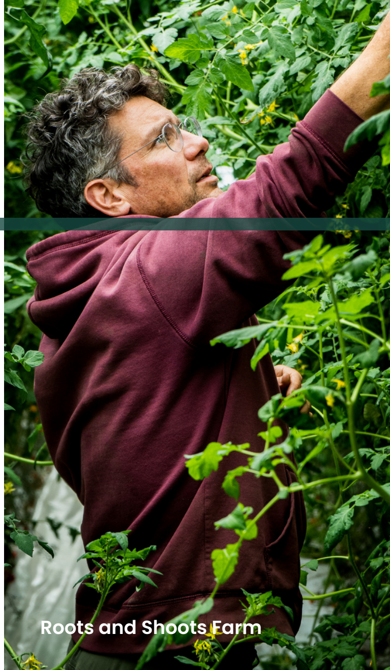
Roots and Shoots Farm