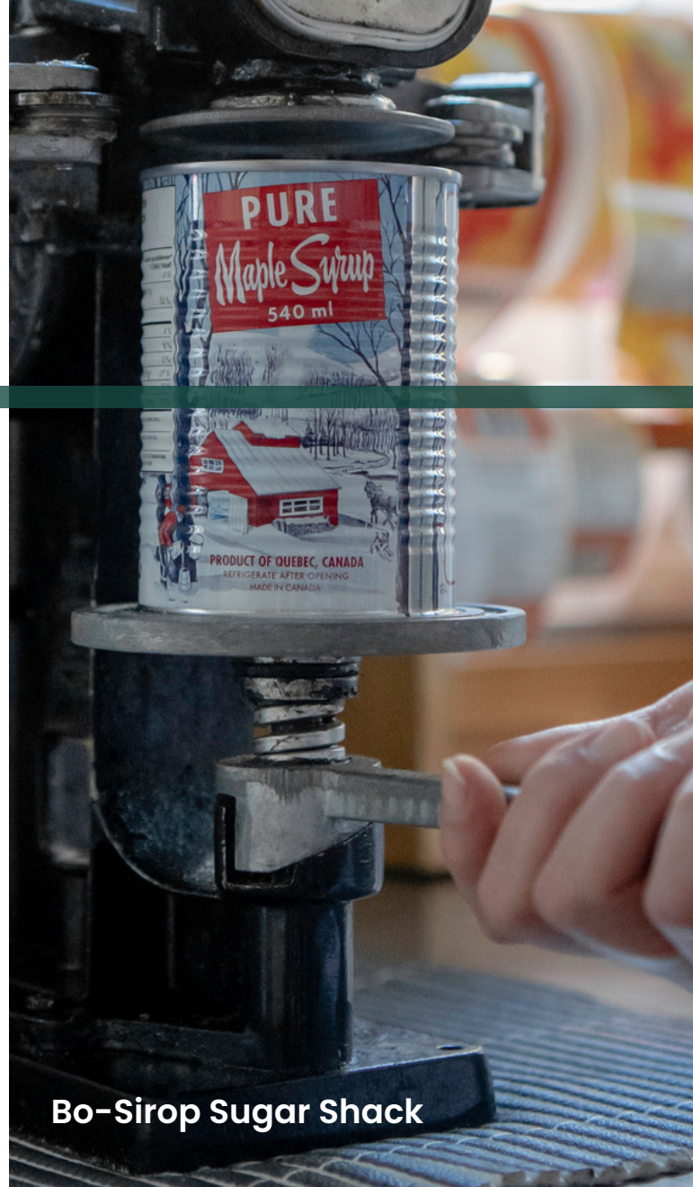
Bo-Sirop Sugar Shack